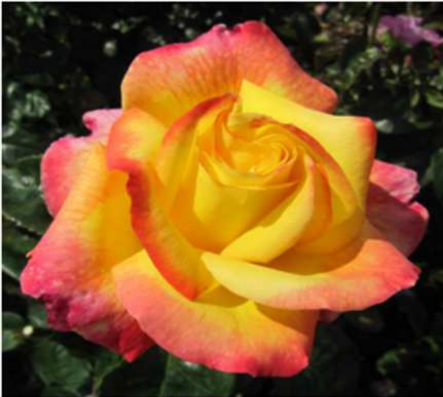
Love & Peace Rose